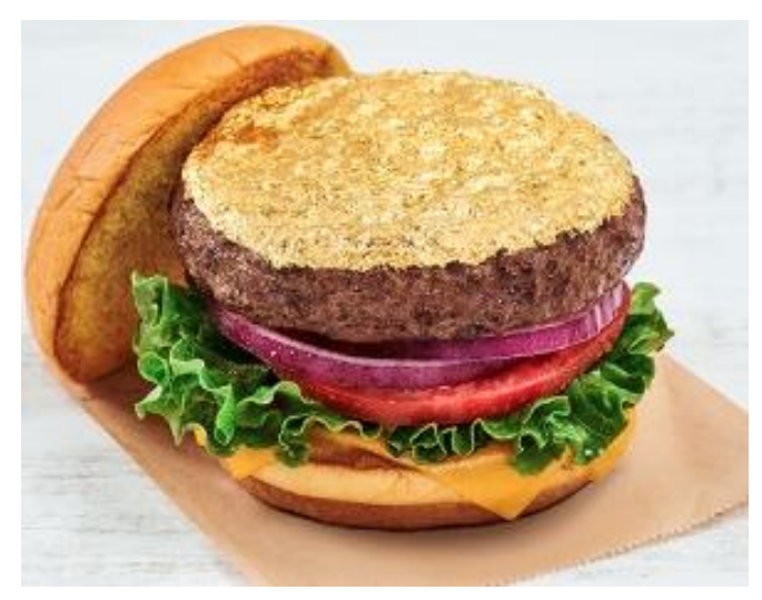
24-Karat Gold Leaf Steak Burger

Hard Rock Café has recently launched new additions to its lunch and dinner menus! Appetizers, Burgers, Milkshakes, and Cocktails galore on the expansive menus. Focusing on the freshest ingredients, Hard Rock Café has added new entrees to the menu including "The Impossible Burger," which is a 100% plant-based vegan patty topped with cheddar cheese and a crispy onion ring, served with lettuce and vine-ripened tomato. The menu wouldn't be fit for a rock star without an extravagant addition like the 24-Karat Gold Leaf Steak Burger—a 1/2 -lb fresh steak burger topped with a 24-karat edible gold leaf. All proceeds from the 24-Karat Gold Leaf Steak Burger will benefit Action Against Hunger through the Hard Rock Heals Foundation.